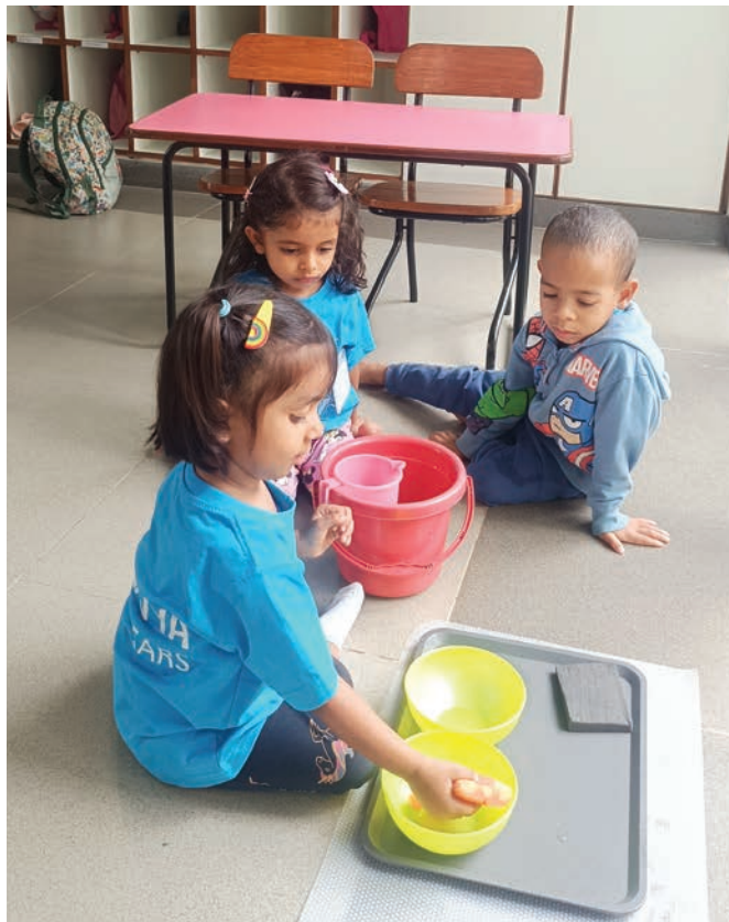
FMS: Transferring Water Using a Sponge - Kg children practised transferring water from one bowl to another using a sponge this month. They carefully soaked the sponge, squeezed the water into another bowl and repeated the process with great focus. This activity strengthened their hand muscles, improved hand-eye coordination and encouraged concentration, patience and precision.