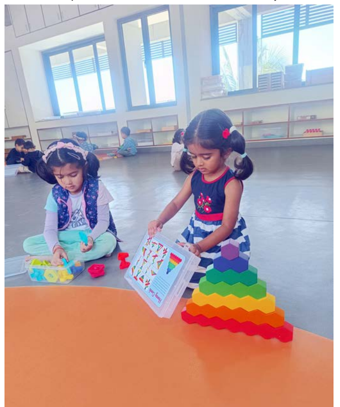
Block Room: PG was introduced to Block Room this month. They were first oriented on how to work quietly and individually with the material. They learnt to use and wind up the material carefully too. They have been enjoying the Block Room time a lot and are working with immense amounts of patience, concentration and creativity.