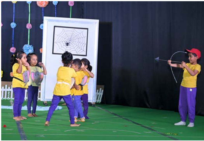
Ek Mota Hathi