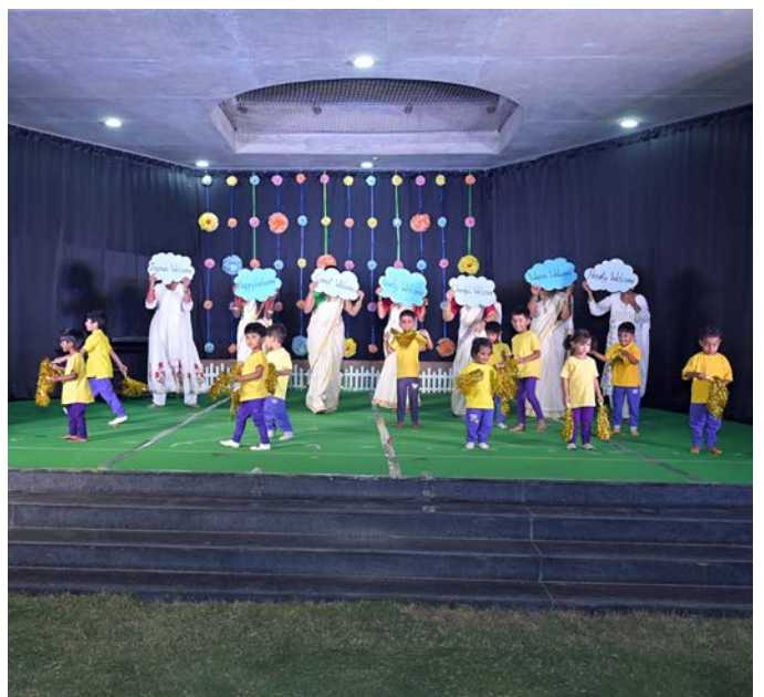
A Hearty Welcome