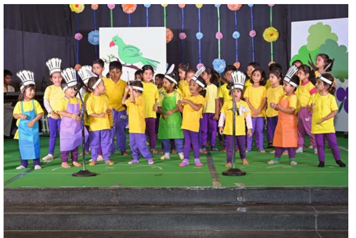
Mix a Pancake