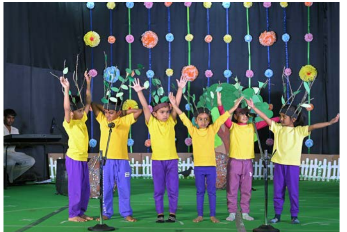
Whispers of the Forest