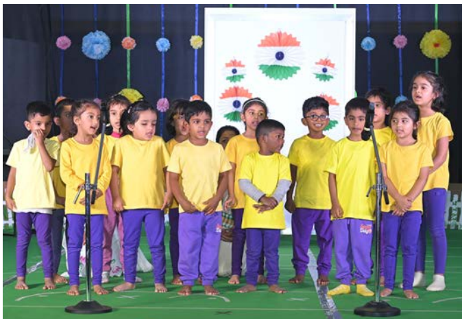
Hind Desh ke Niwasi