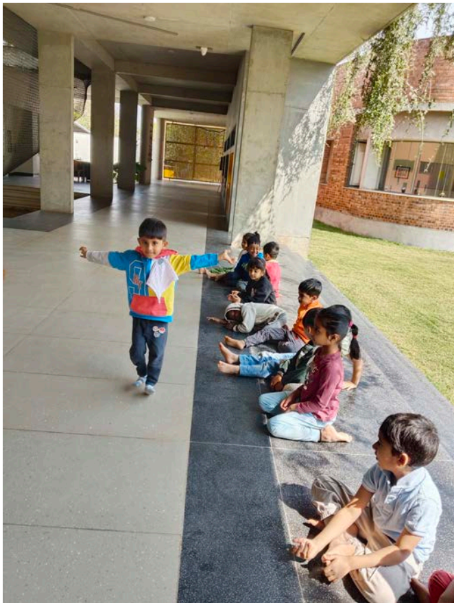
GMS: Matchstick Figures - Kg children enjoyed playing the matchstick figures game this month. A cube with stick figures in different poses is rolled, and the children try to mimic the pose as accurately as possible. Through this activity, they enhance their balance and engage their core muscles. This activity brings a lot of joy and laughter in the classroom too.