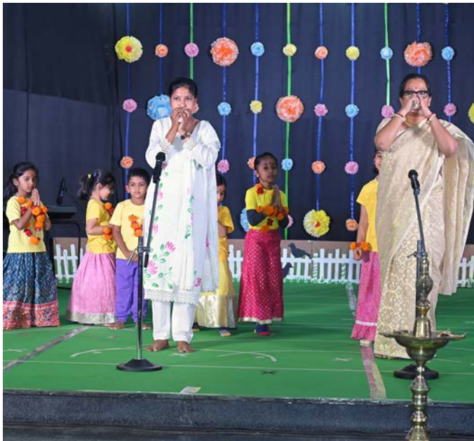
An auspicious start