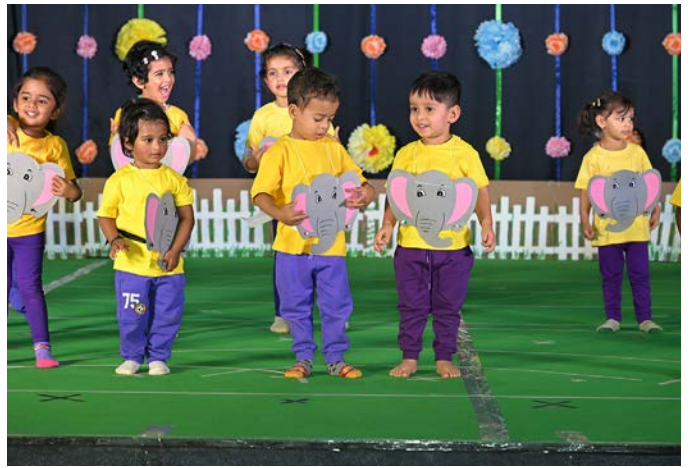
Elephants Have Wrinkles