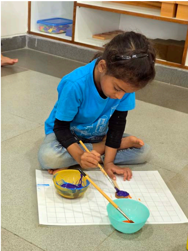
Art: Making dots using Q Tips - TG children enjoyed making making dots using a bunch of Q Tips this month. Making dots is not only a fun art activity, but also a great fine motor skills activity. Children learn to control their hand and not give in to the temptation to just use the Q Tips like a paintbrush. They also need to use precise movements in order to make beautiful round dots.