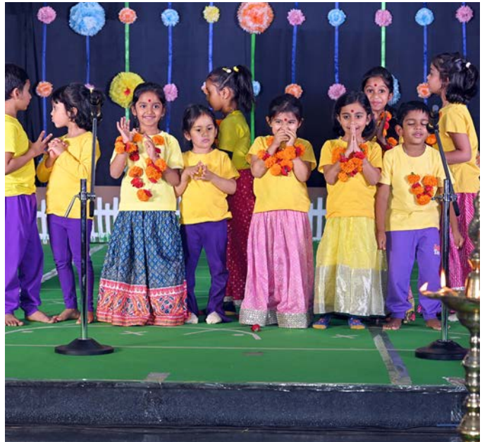
Starting with a shloka