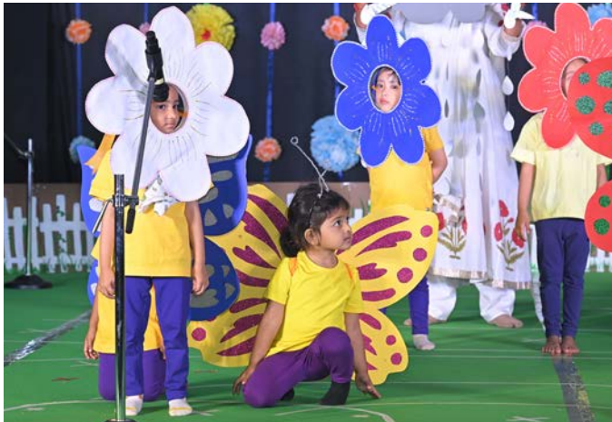
Beautiful butterflies and flowers