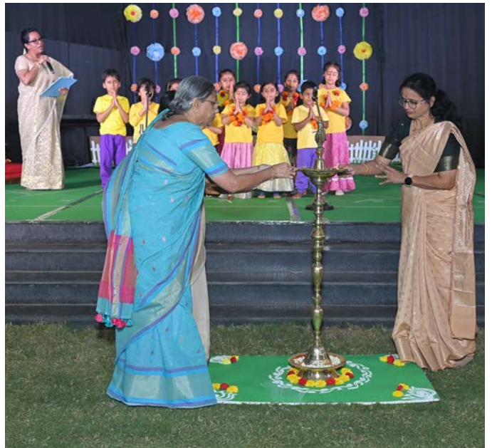
Lighting of the lamp by Chief Guests